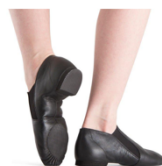
10 10.5 11 11.5 + 10 S04990 - Bloch Elastaboot Childrens Jazz Shoe $74.95 AUD