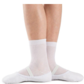
9 9.5 10 10.5 + 8 S02130 - Bloch Prolite II Canvas Boys Ballet Flat $34.95 AUD White