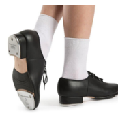
9 9.5 10 10.5 + 6 S03018 - Bloch Jazz Childrens Tap Shoe $119.95 AUD

Shoes from BLOCH Dancewear Manuka, but you can buy any brand.