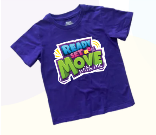
Ready Set Acro T-Shirt $25

READY SET ACRO is a 30-minute/45-minute class led by Flexy the Giraffe, Bridgie the Elephant and Flip the Penguin! Check out more here! https://youtu.be/W4dP9deAAbE .