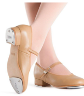
9 9.5 10 10.5 + 6 S03020 - Bloch Tap On Girls Tap Shoe $74.95 AUD Tan

Boys: Class wear (all styles) - Shorts (bike pants are better) and t-shirt are available from Kmart, but you can buy any brand.