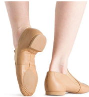
10 10.5 11 11.5 + 10 S04990 - Bloch Elastaboot Childrens Jazz Shoe $74.95 AUD Tan