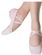
10 10.5 11.5 12 + 8 S02840 - Bloch Performa Stretch Canvas Childrens Ballet Flat $44.95 AUD Theatrical Pink